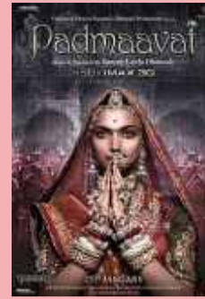
26 Feb 2018 Padmaavat (Hindi)