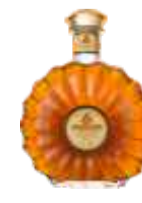
FAUCCONNIER NAPOLEON VSOP BRANDY

MEMBERS REQUESTED TO CONTACT THESE PERSONS IN FUTURE.