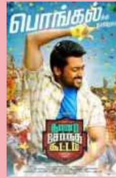
3 Feb 2018 Thanaa Serndha Koottam (Tamil)