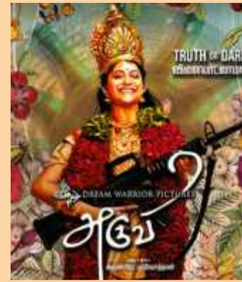
20th Jan 2018 Aruvi (Tamil)