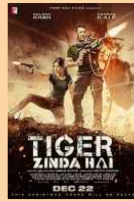
6th Jan 2018 Tiger Zinda Hai (Hindi)